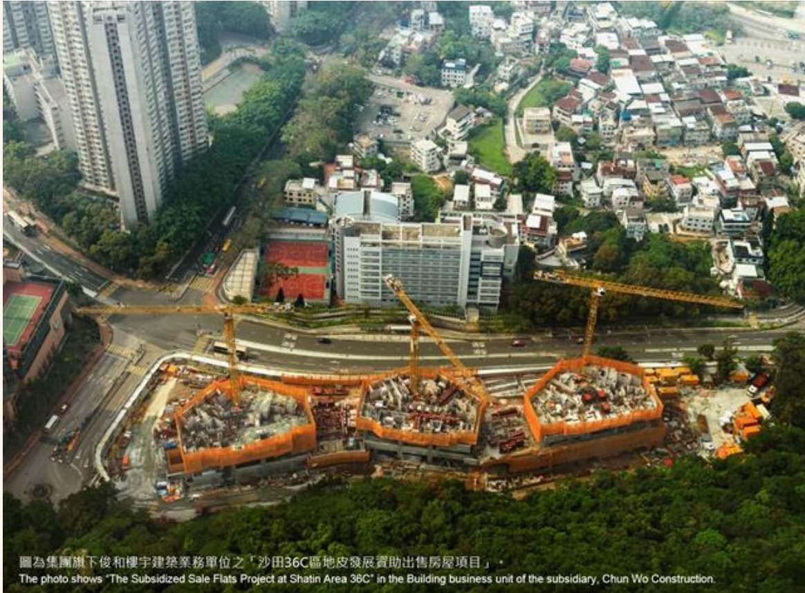
圖為集團旗下俊和樓宇建築業務單位之「沙田36C區地皮發展資助出售房屋項目」。 The photo shows "The Subsidized Sale Flats Project at Shatin Area 36C" in the Building business unit of the subsidiary, Chun Wo Construction.

使用嶄新科技來推動建築行業發展是大勢所趨 ，集團旗下俊和樓宇建築業務單位已於2013年應用建築信息模擬(BIM)技術於建築繪圖上，現時積極推廣至工地施工，即場運用BIM解決工程問題。目前，公司已投放近300萬港元資金於BIM團隊的課程培訓、器材和各項牌照上，致力提升生產力、優化項目管理及提高整體競爭力。