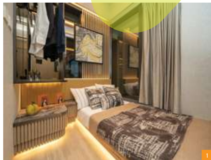
1 The Show Flat of 61-67 Soy Street, Mong Kok, Kowloon 九龍旺角豉油街61-67號示範單位