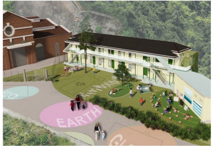
Photo (left) & Artist's Impression 1 (right): The existing Tai Tam Tuk Raw Water Pumping Station Staff Quarters (left) will be revitalised into a school building for the Earth Campus (right).