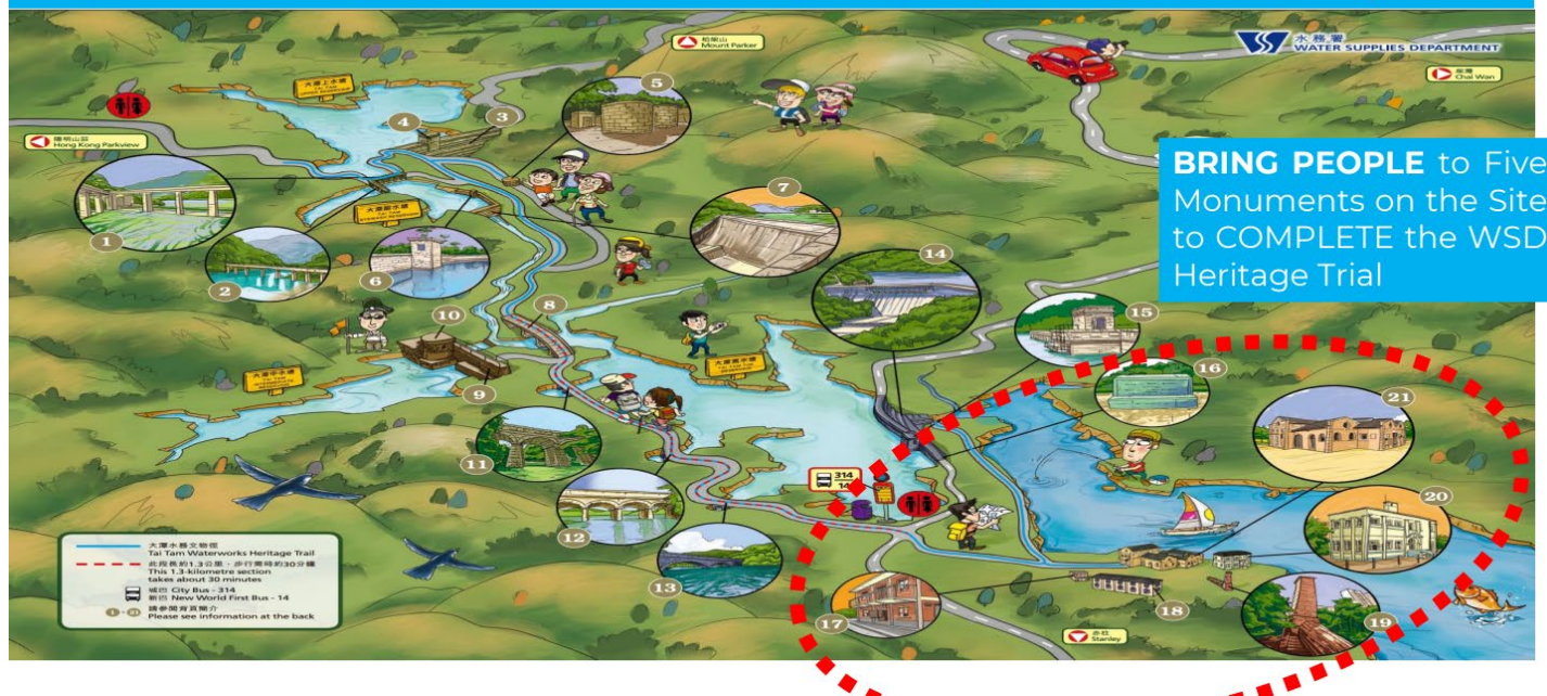
Diagram: The "e.a.r.t.h. Project" will integrate the five monuments of the Tai Tam Waterworks Heritage Trail in the red circle with other monuments along the Trail, so that visitors can fully embrace the history of Tai Tam waterworks in Hong Kong through all the 21 monuments.