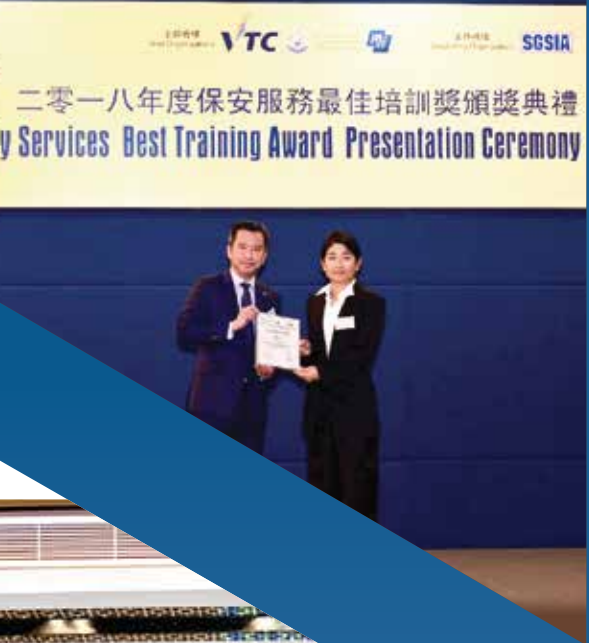
二零一八年度保安服務最佳培訓獎頒獎典禮 Security Services Best Training Award Presentation Ceremony